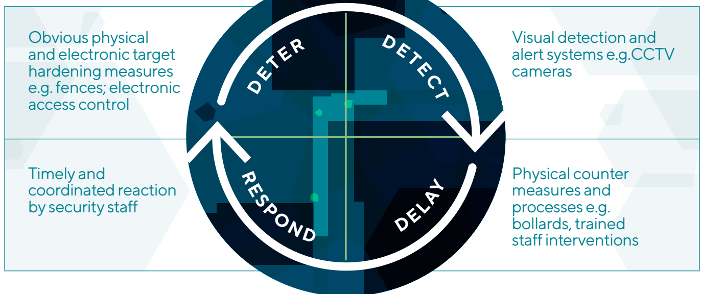
Figure 2: Layered Security

Refer to Figure 3 for examples of protective security measures in each layer that owners and operators of crowded places can use. Some security measures strengthen more than one layer. For example, security officers can help to deter, detect, delay and respond to an attack.